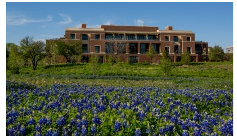
The Bush Center from the south, overlooking the Native Texas Park.

A one mile network of paths will take you through native Texas environments such as Blackland Prairie, Post Oak Savannah and Cross Timbers Forest.