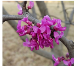
Texas Redbud Flower