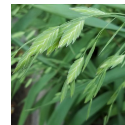
Inland Sea Oats