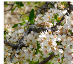
Mexican Plum Flower