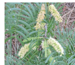
Texas Mesquite Flower