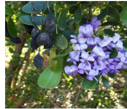
Texas Mountain Laurel